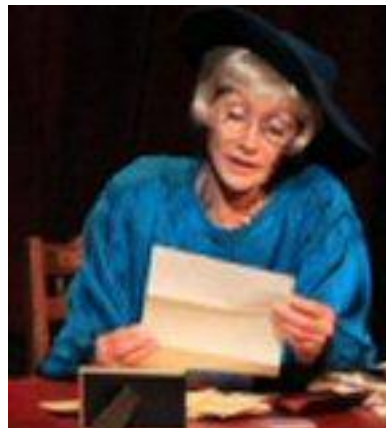
The Honorable Jeannette Rankin