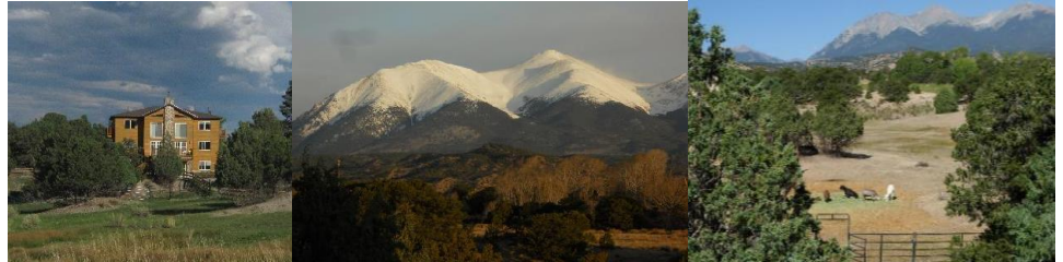
Photo of Chaffee County